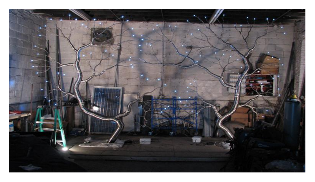
"Constellation Bonzai" under constriction in Josh Hadar's New York City Studio.

The installation itself is entirely hand made from Carbon Steel. Hundreds of industrially straight pieces of steel tubing were welded together to create an organic looking Bonzai-like structure. The LED lights are powered by two submerged solar panels located in the base of each sculpture. During daylight hours, the solar panels generate electricity, which charge a series of batteries hidden within the "trunk" of each tree. As the sun wanes at the end of the day, sensors within the trees detect the diminishing light levels on the panels, and the tree automatically switches into light mode and illuminates over 110 LEDs set into the tip of each branch.